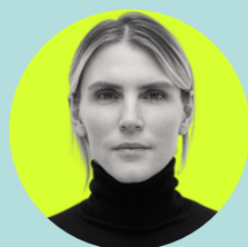
Gabriela Hearst Climate Success: Fusion Energy as a Solution